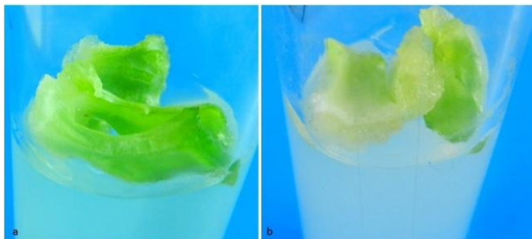
Fig. 2 The reaction of safflower explants to in vitro cultivation. Positive response of fragments of cotyledon leaves (a) and hypocotyls (b).

leaves (rate of callusogenesis 67.34%) comparative to response explant collected after 21 days (35%) (fig. 2).